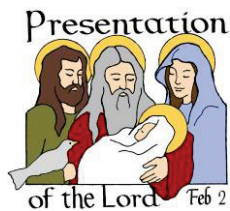
of the Lord Feb 2

Grade 2 Candidates for First Holy Communion as they are presented to us and begin their preparations for this important moment in their lives.