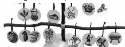
The History of the "Jesse Tree"

Standing next to the organ is a stylized Jesse Tree. It represents the ancestral family tree of Jesus. Our Jesse Tree is decorated with symbols from